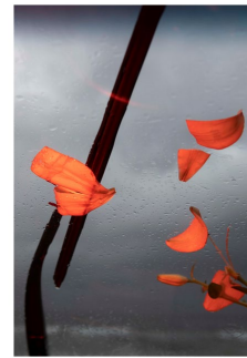
The resource contains narratives of domestic and family violence.