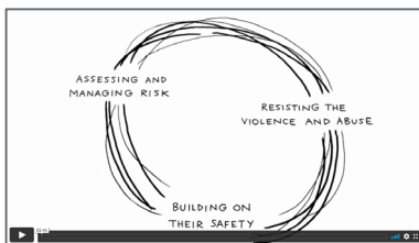
An introduction for responders (2.4mins)