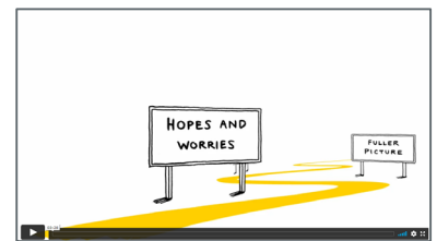
Decision Making Tool (3.5mins)